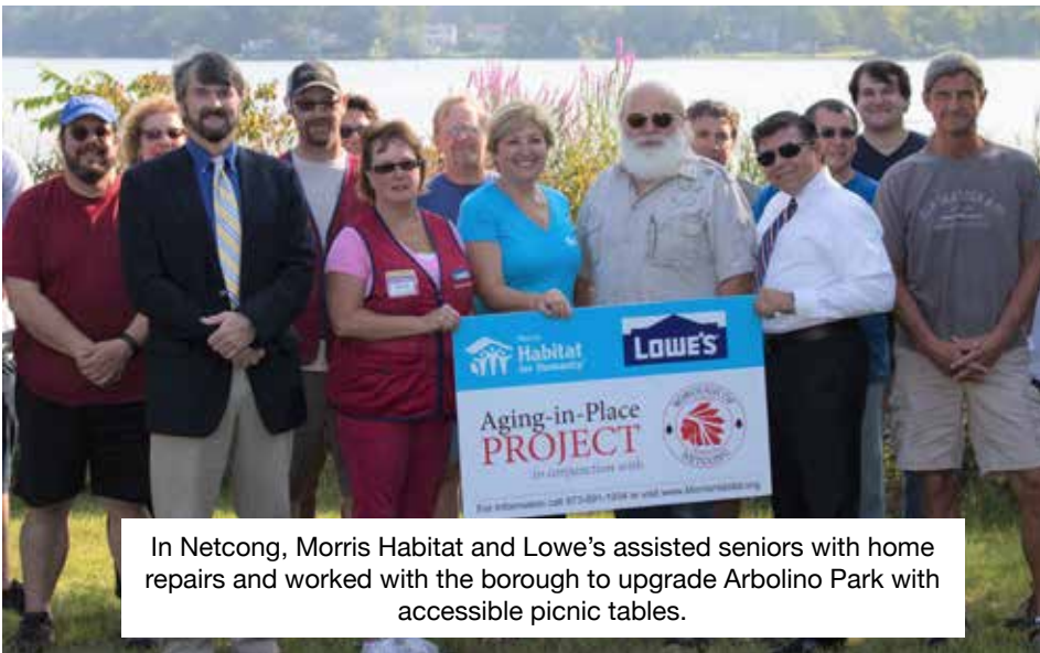
In Netcong, Morris Habitat and Lowe's assisted seniors with home repairs and worked with the borough to upgrade Arbolino Park with accessible picnic tables.